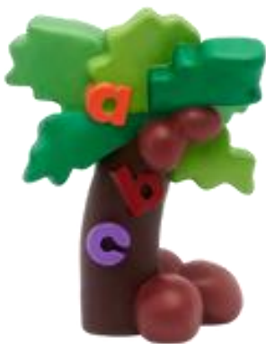
Chicka Chicka Boom

No speaker is included with individual characters.