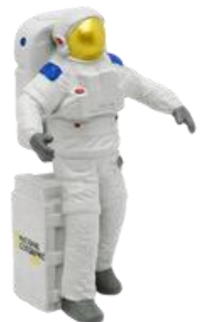
National Geographic Astronaut