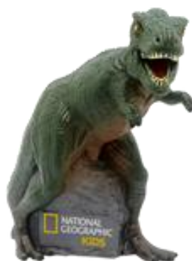
National Geographic Dinosaurs