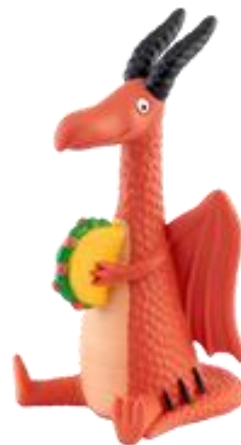
Dragons Love Tacos